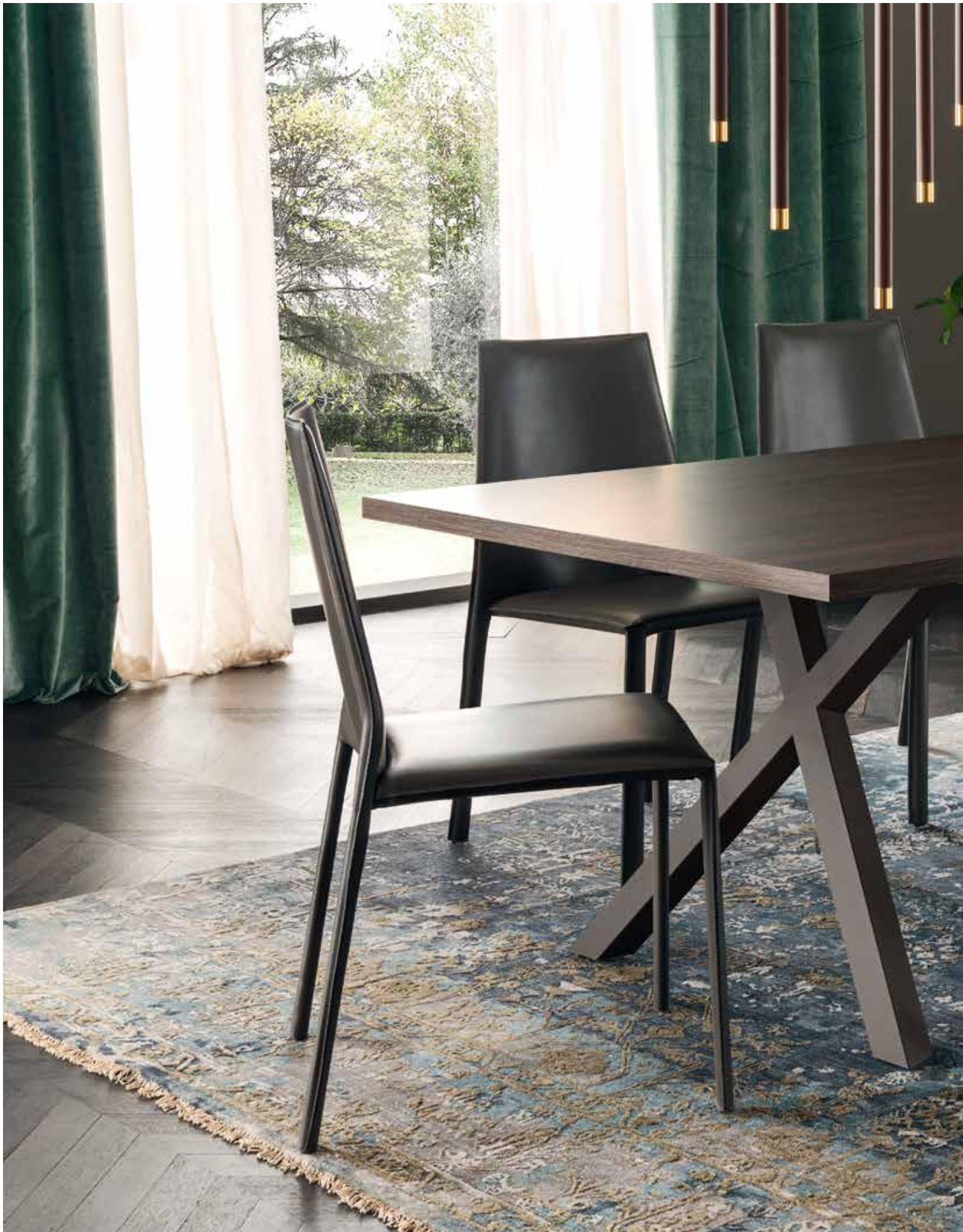
Sedie Corium: for this article please see "COMPLEMENTS" Alf DaFrè