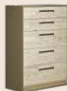
5/DRW. CHEST KJJO117 With 5 drawers and light

inch W 28" D 18" H 26" cm L 71,2 P 45 H 67 Crts 1 kg 36 m 3 0,29