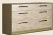
DRESSER KJJO125 With 6 drawers and light

inch W 67" D 19" H 36" cm L 169 P 49 H 91,5 Crts 1 kg 97 m 3 0,93