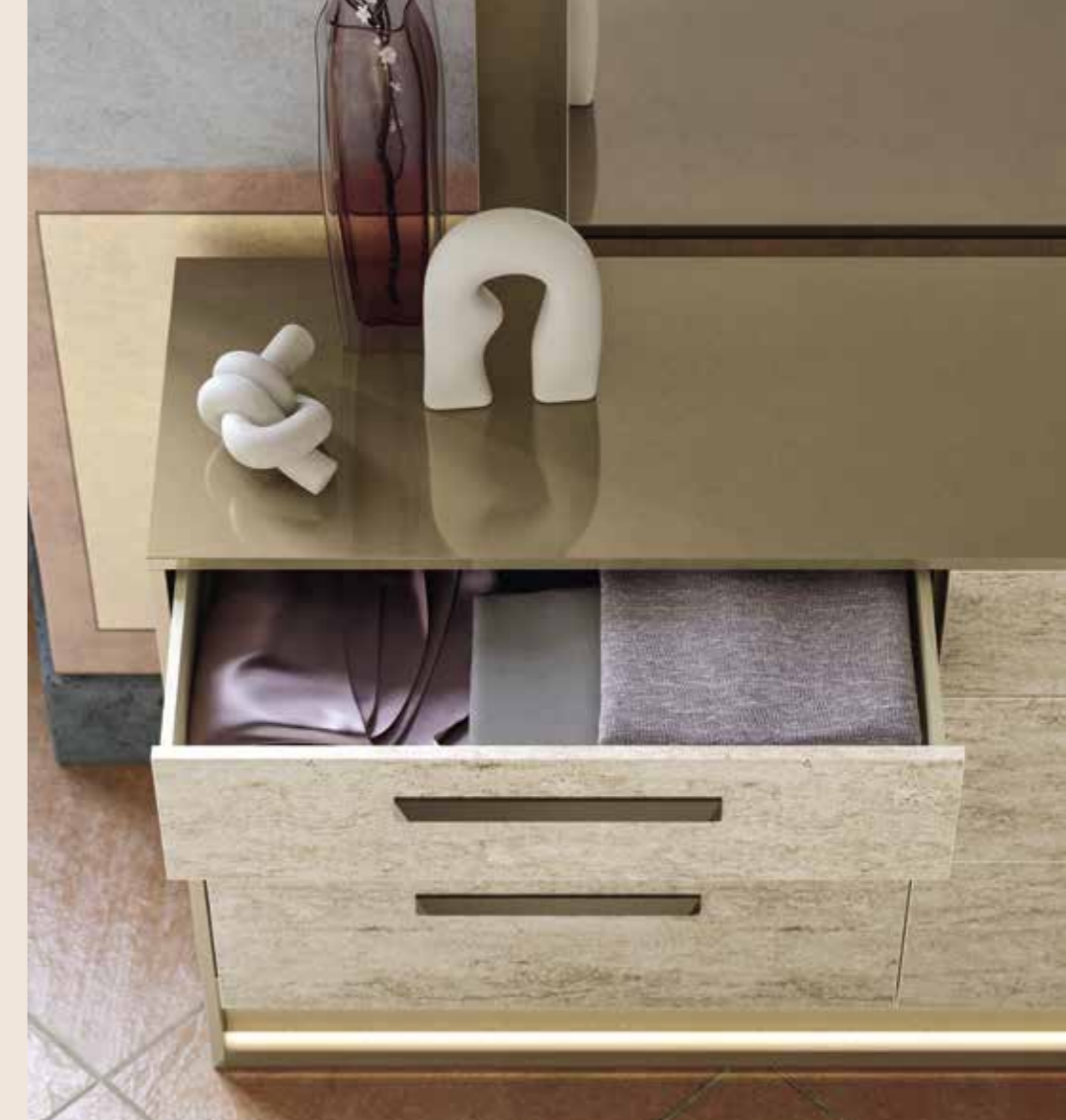
Jo bedroom set, roman interior