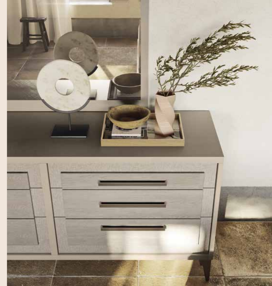
Jo bedroom set, roman interior

Общая эстетика достигает тонкого равновесия, сочетая светлые цвета с излучающими яркую индивидуальность формами.