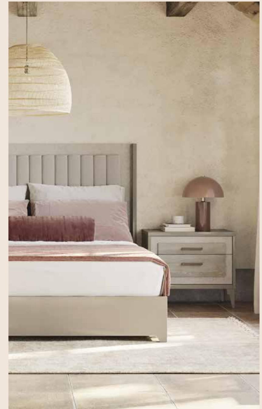
Jo bedroom set, roman interior

Теплые оттенки и нежные тона характеризуют дизайн Ellen, наполняя спальню манящей аутентичностью, напоминающей о тосканском фермерском доме. Архитектурное вдохновение проявляется в изысканных деталях, таких как ритмичные узоры мягкого изголовья и глубина выдвижных ящичков.