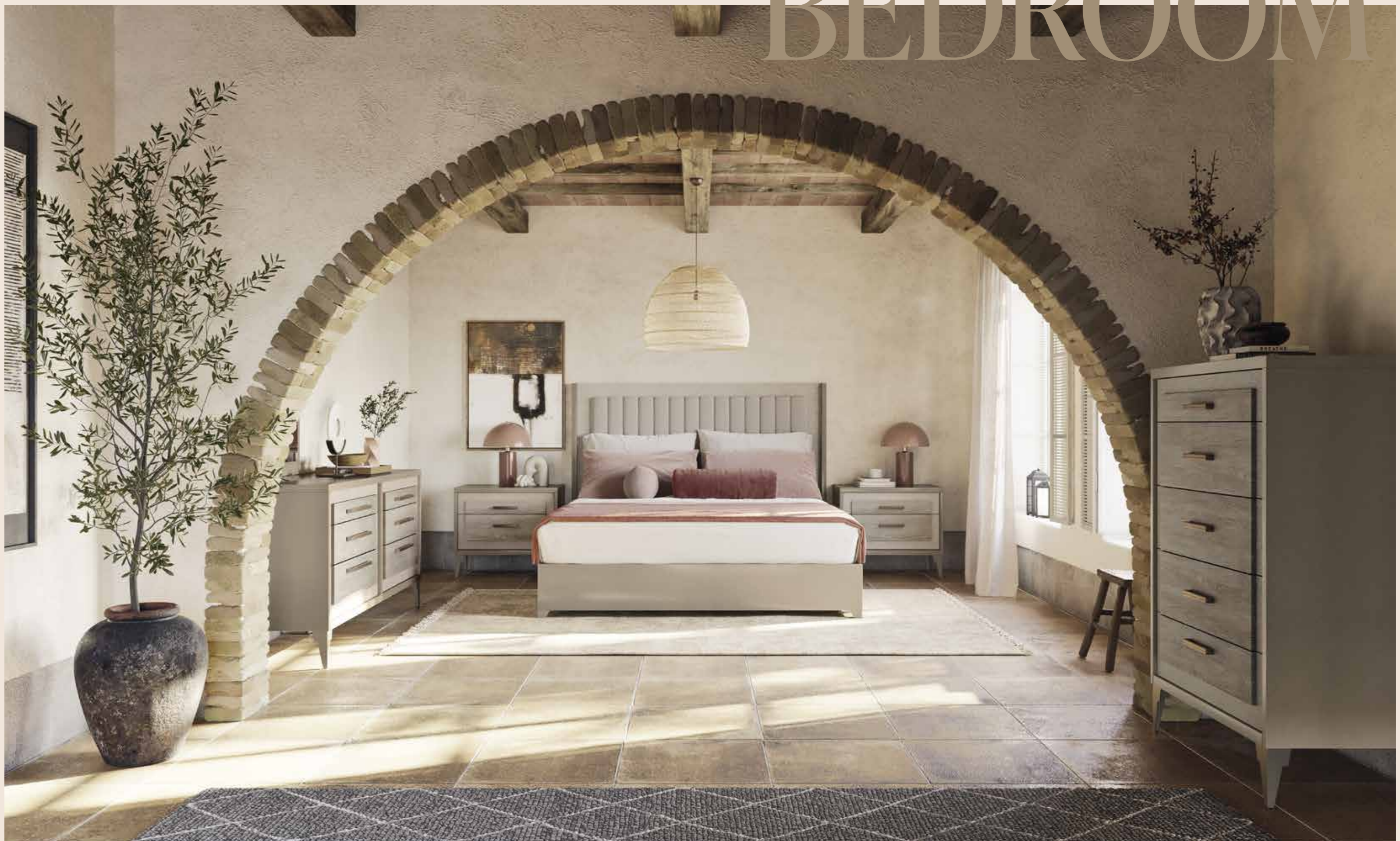
Jo bedroom set, roman interior