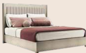
Q.S./UK 5" BED PJEN0150 (UK FIRE RETARDANT) PJEN0150I

inch W 37" D 1" H 43" cm L 94,7 P 2,5 H 110 Crts 1 kg 25 m 3 0,07